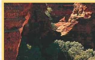
5 Nights SAHARA 5 DAY RED CENTRE TOUR NORTHERN TERRITORY (TWIN SHARE)