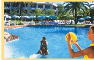
5 Nights SEAWORLD NARA RESORT SURFERS PARADISE SUPERIOR ROOM