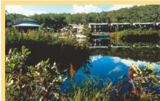
6 Nights KINGFISHER BAY RESORT & SPA FRASER ISLAND RESORT ROOM