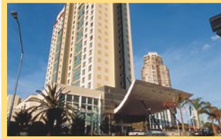
5 Nights HOTEL WATERMARK GOLD COAST SUPERIOR ROOM