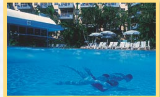
5 Nights SHERATON NOOSA NOOSA NOOSA VIEW ROOM Excluding School hols & special events