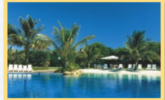
6 Nights RYDGES CAPRICORN YEPPON STANDARD ROOM