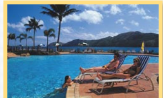
6 Nights DAYDREAM ISLAND RESORT & SPA WHITSUNDAYS - GARDEN ROOM Excluding Christmas Holidays

Accommodation based on per room twin share unless otherwise stated.