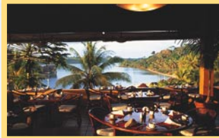
4 Nights LE MERIDIEN PORT VILLA RESORT AND CASINO - VANUATU STANDARD ROOM Note airfares not included