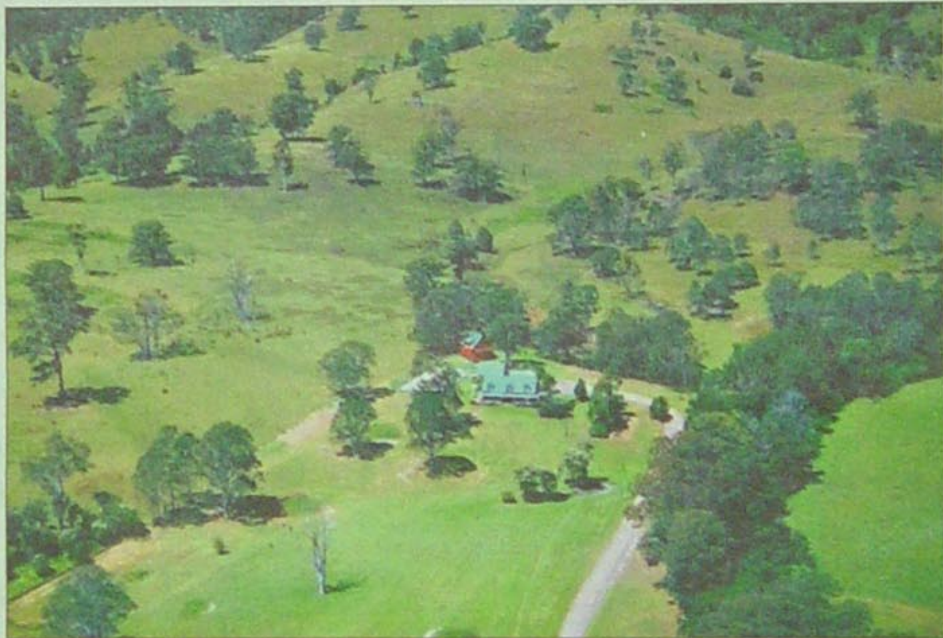
COUNTRY COMFORT: The 4.45ha property includes homestead, guest cottage, tennis court, pool and four-hole golf course.

Also on the property is a four-hole golf course, creek, tennis court and